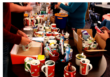
Students work as a team to assemble the cup care packages.