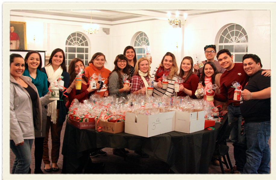
Cup Runneth Over 2014