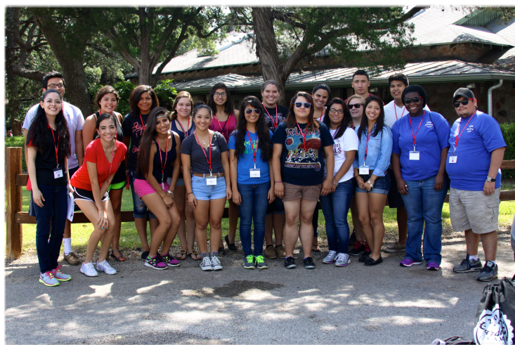
TRiO 2014 Cohort at Cardinal Camp New Braunfels, TX