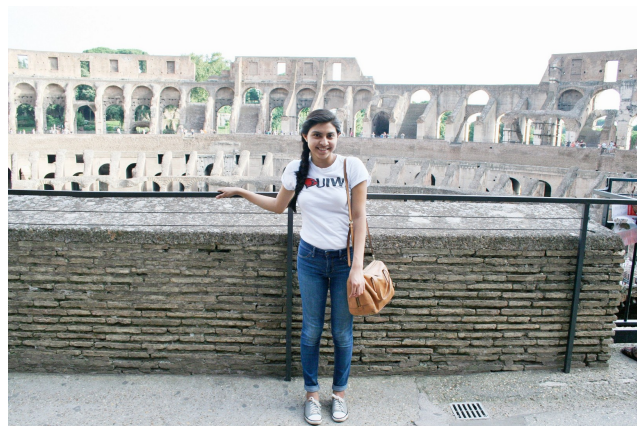
Taking a tour of the Colosseum in Rome, Italy.

A: In general, all the trips were wonderful and full of history. Out of all the excursions, the most challenging was the visit to a concentration camp during our weekend trip to Berlin. Being in the camp and getting the opportunity to see and remember all the history that happened there was very sad and uncomfortable for me.