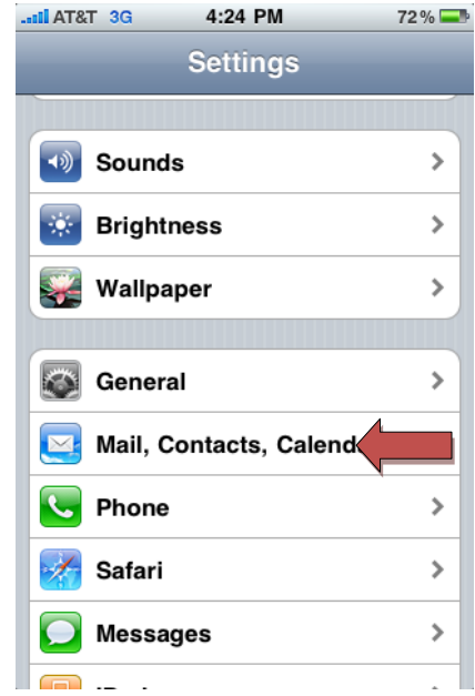
select Add Account